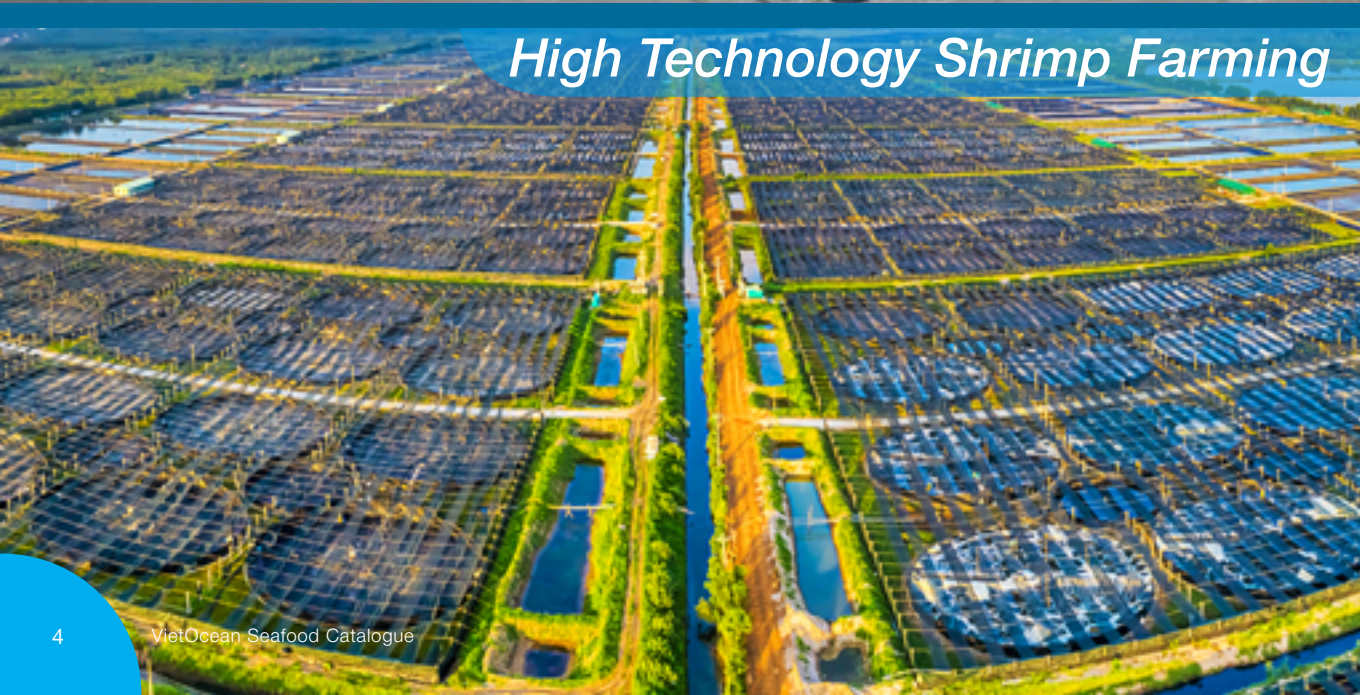
High Technology Shrimp Farming