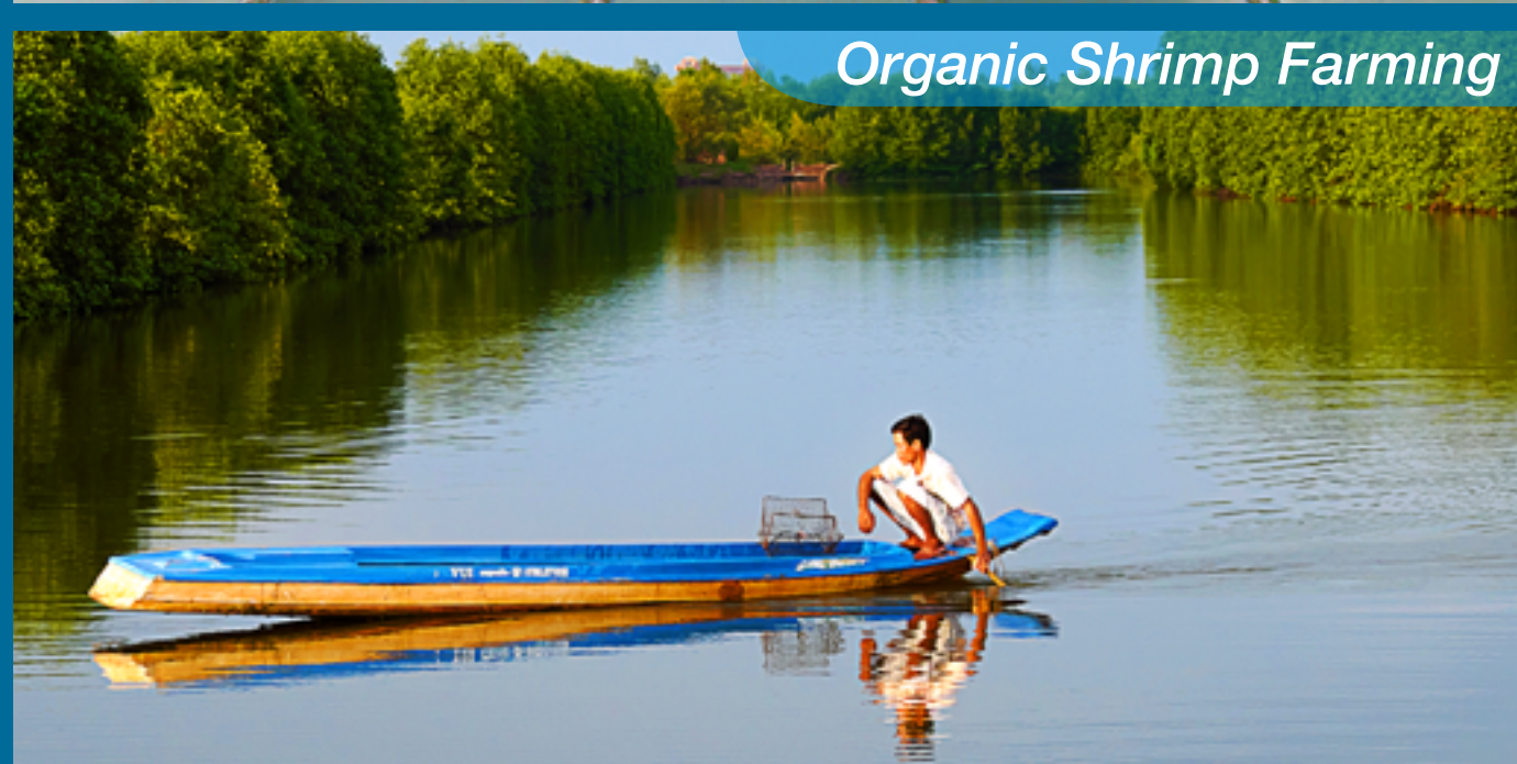
Organic Shrimp Farming